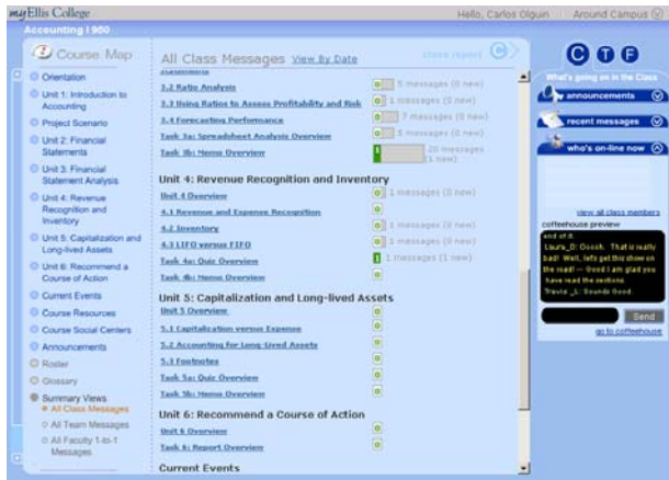
Figure 3: Report View

MOOD was born out of the rising tide against what we call “bucket based learning” platforms that are driven by